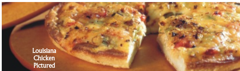
Louisiana Chicken Pictured

Yesterday is history, tomorrow is a mystery, but today is a gift. That's why we call it the present.